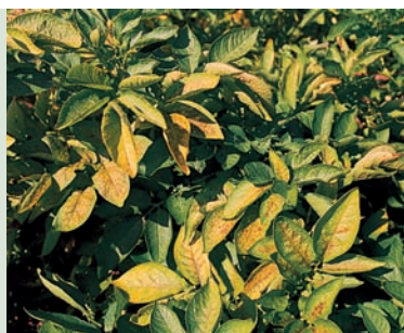
Magnesium deficiency in potatoes