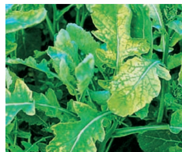
Sulphur deficiency in oilseed rape