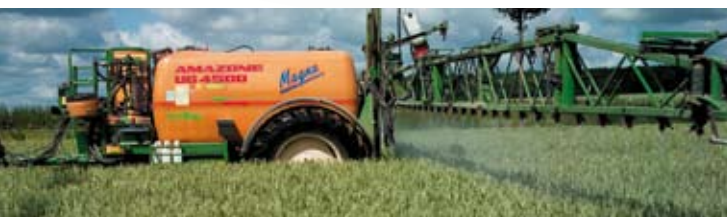
Applying EPSO Combitor® to wheat

© = registered trademark of K+S KALI GmbH