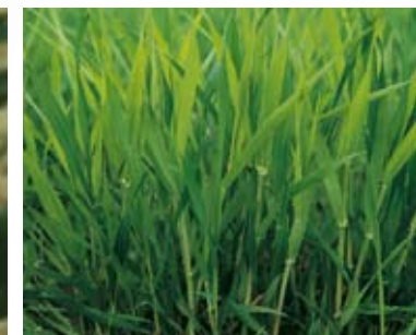
Sulphur deficiency in barley