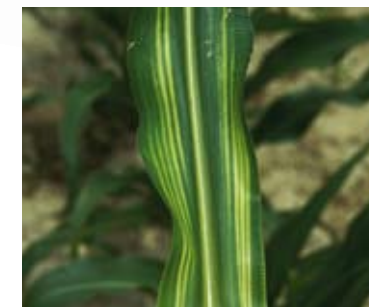
Zinc deficiency in maize